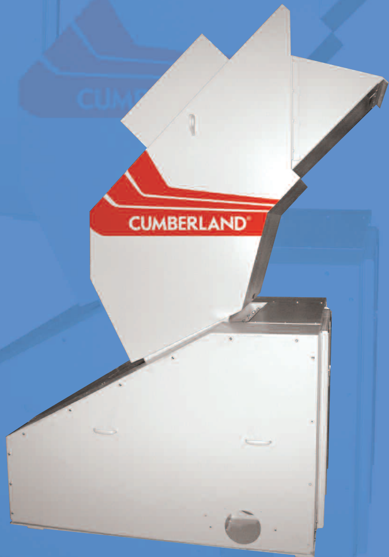
2045TF Series Granulator