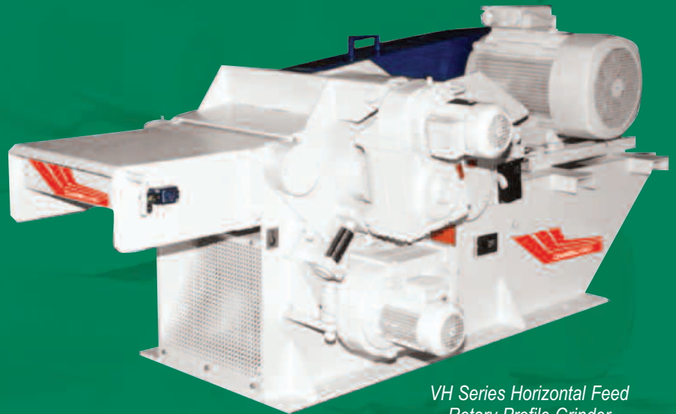
VH Series Horizontal Feed Rotary Profile Grinder